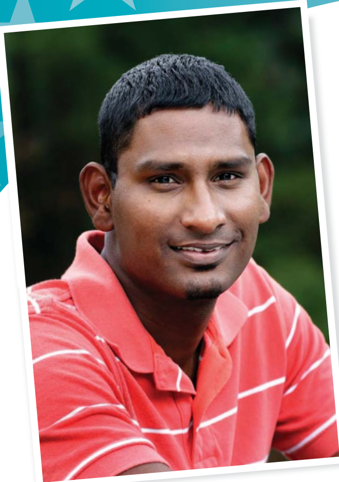
Principal Investigator for the Systems Biology Group in the Biostatistics Branch, National Institute of Environmental Health Sciences